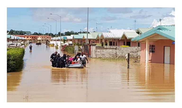
Figure 1: Flood in Trinidad and Tobago, 2018