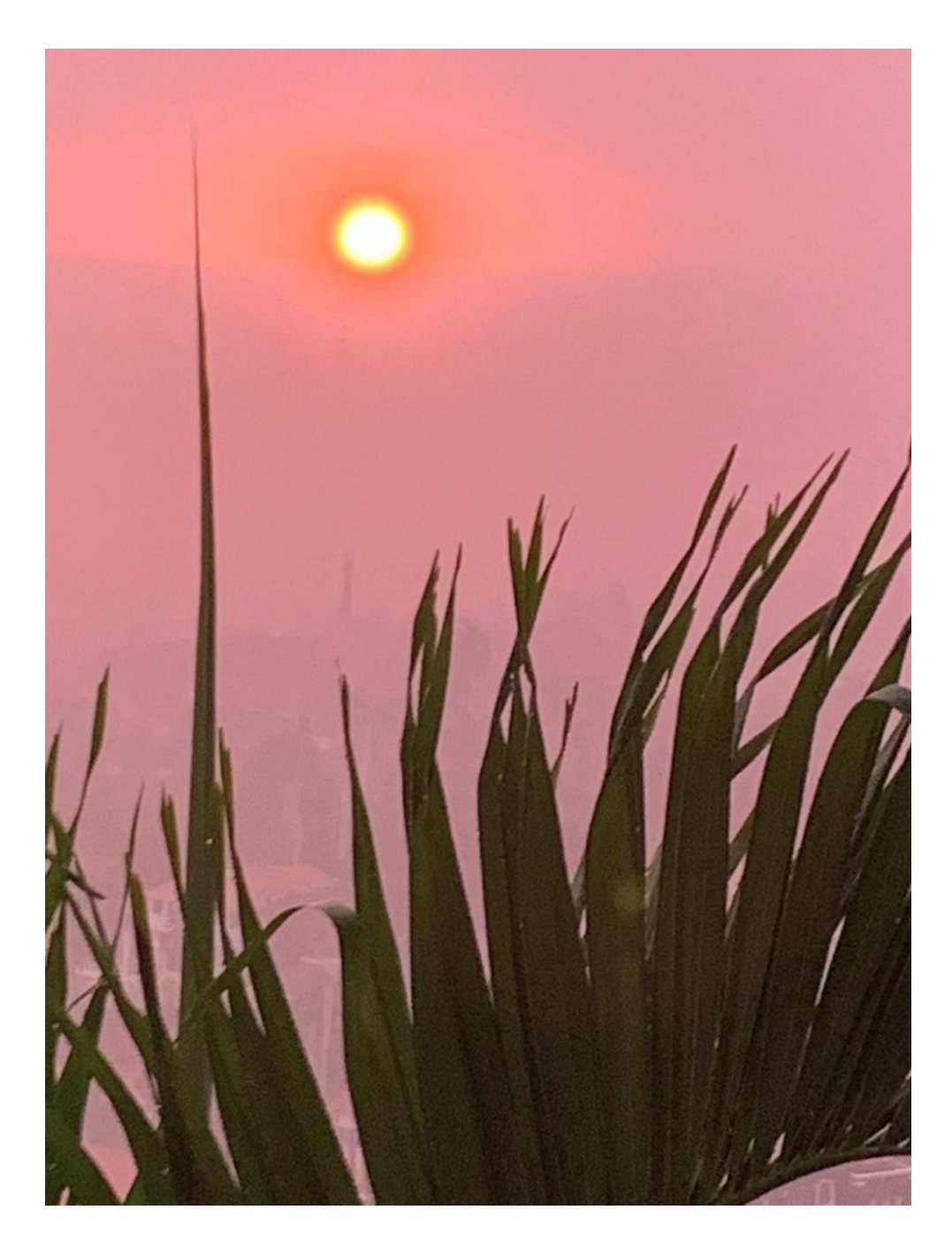
DOMAIN 1: CLIMATE CHANGE HEALTH IMPACTS, EXPOSURES AND VULNERABILITY